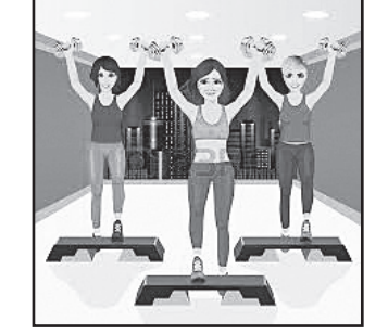
Union County Recreation Department 2018 Evening Step-Aerobics Program Ages: 50 and over

The only 7 p.m. tip-off is Friday at GAC.